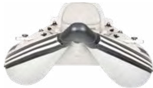
Unique Catamaran Hull Design with High Pressure Drop-Stitch Floor 7" above the bottom of pontoons make this kayak far more efficient.