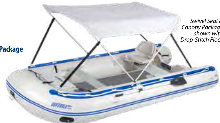
Swivel Seat & Canopy Package shown with Drop-Stitch Floor