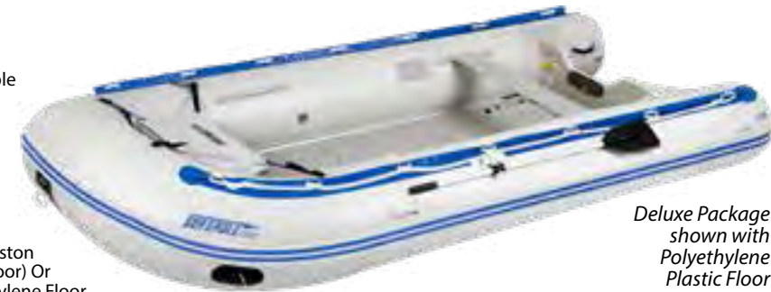
Deluxe Package shown with Polyethylene Plastic Floor