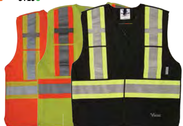
6135O 6135G 6135BK