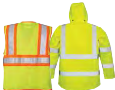
USA back configuration