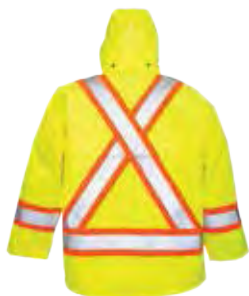
Canada back configuration