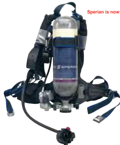
Sperian is now Honeywell