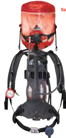
Sperian is now Honeywell

Stock configuration includes: Survivair Cougar/Puma, 2216 psig (153.8 bar), plain whistle alarm (22PW). 2216 psig (153.8 bar), 30-minute aluminum cylinder, without locking collar (915141). Survivair Puma hood with medium nose cup (968006)