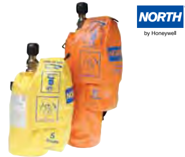
845 and 850