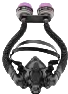
BP1002 Shown here with 7700, mask not included